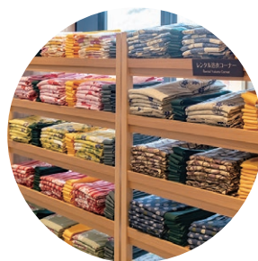
YUKATA New main building guest : Free EAST & ANNEX guest : 1000yen 【Place : New main 3F】