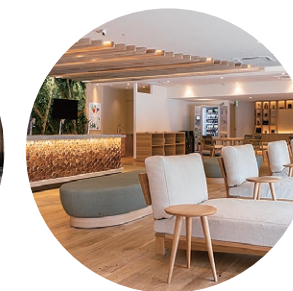
Rest area after bathing

※Please wear swimsuits or bathing suits in the mixed bathing area