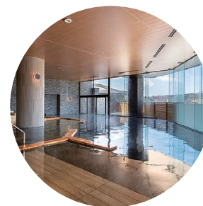
Hot spring KINOYU