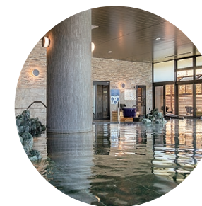
Hot spring ISHINOYU