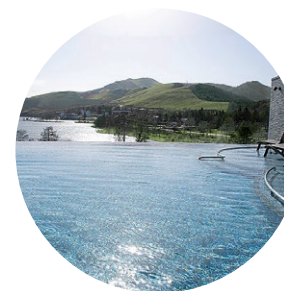
Open-air bath SORA